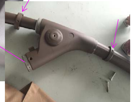
Take out the three caps