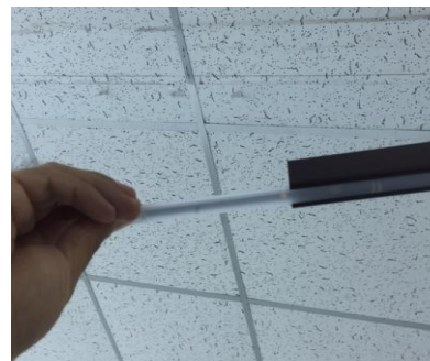
4. Separate the connector of the LED strip from the buckle, then pull out the LED strip.