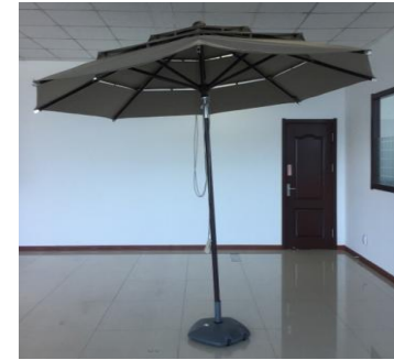
3. Open the umbrella.