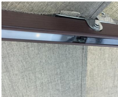
6. Connected the LED strip and the buckle, and a clicking sound will be heard.