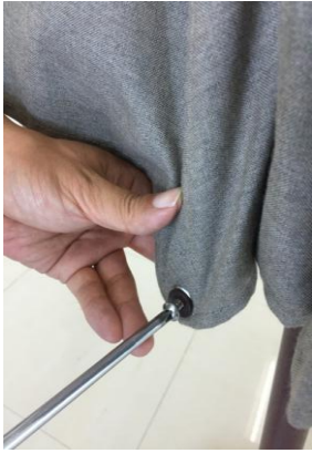
1. Unscrew to remove the rib end.