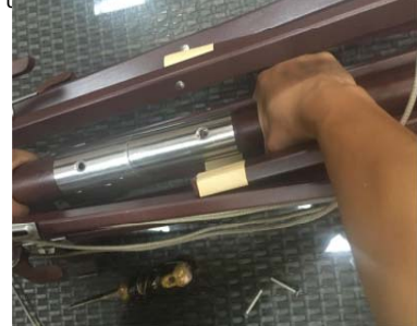
6. Grasp the upper pole and insert the upper 7. Use driller to assemble back the screws. of the tilt mechanism