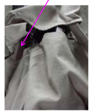
1. There are six screw spikes in the tilt, three 2. Remove the three screws from the upper part of