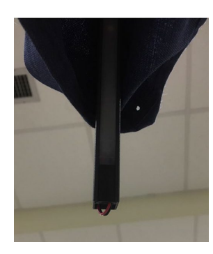
Insert the black plastic cover to the end of the long rib.