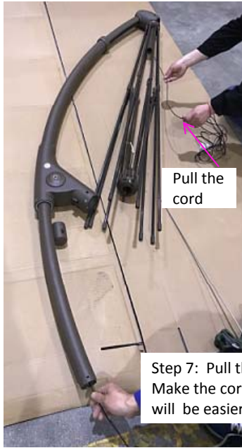
Step 7: Pull the cord at end near lower hub. Make the cord at the other end straight and it will be easier to go through the pole.