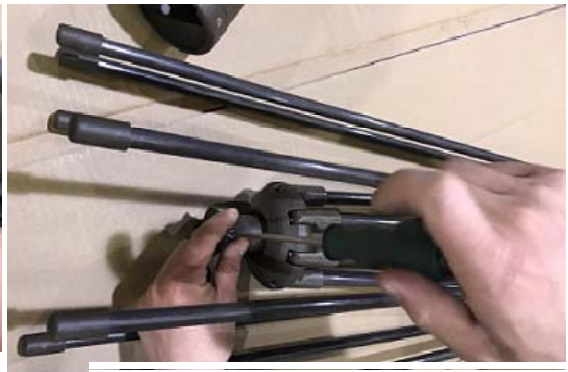
Step 10: Fix the connector and screw it.