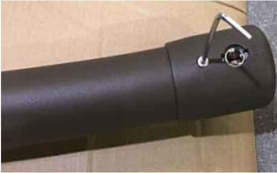
Step 11: Fix sliding tube end.