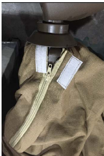
Step 2: There are velcro and zipper on top of canopy. Unzipper and remove the canopy