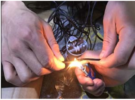
Step 6: Use lighter to make the original cord join with new cord by fire.