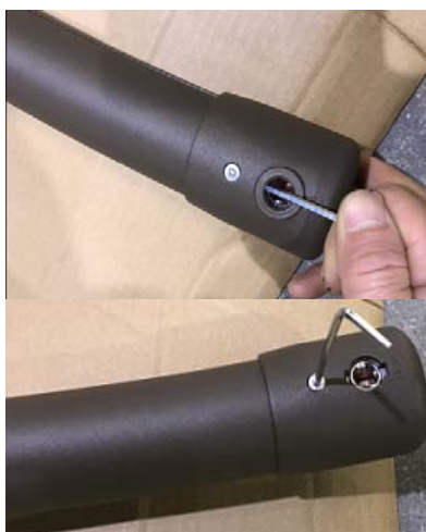
Step 4: Remove the plastic cap and screws at sliding pole end.