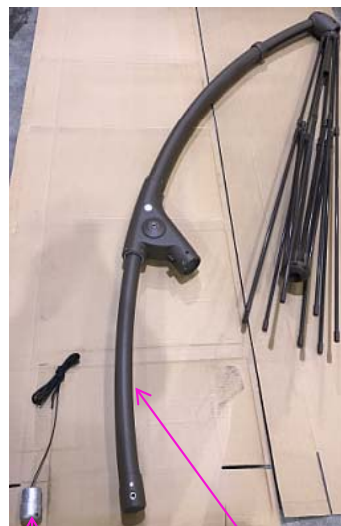
New Crank mechanism with cord