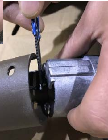
Step 5: Take out the original crank mechanism and cut off the cord.