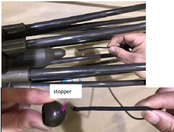
Step 9: Let the new cord go through the lower hub . Make the ribs half open to take out the cord end , go through the stopper then tie a knot and pull into the stopper . Please note the knot is Flemish knot.