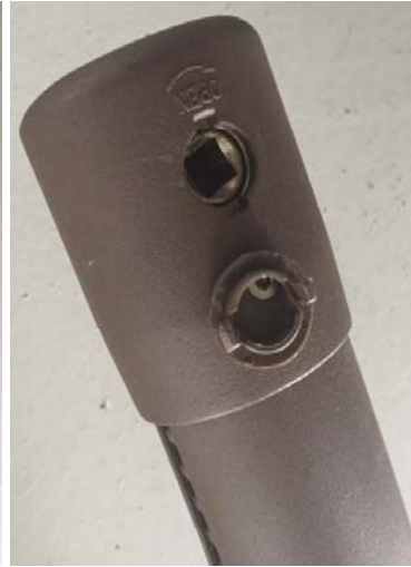
Remove the plastic cap