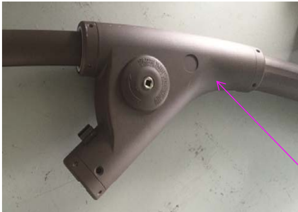
Remove all screws on connector