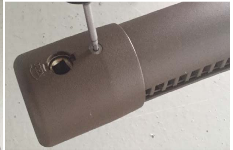
Unscrew and remove the Aluminum cap