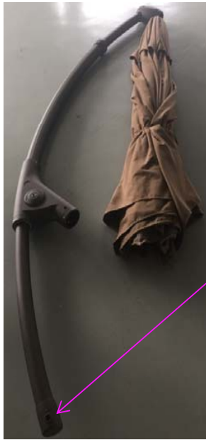
Lay down the umbrella