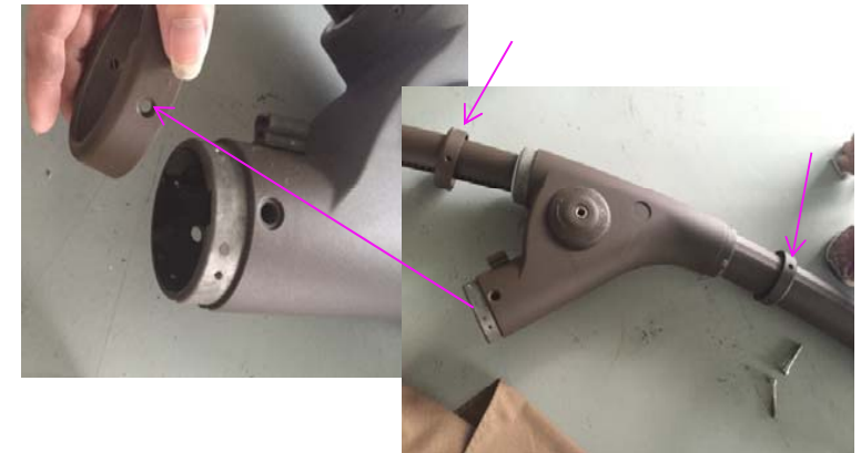
Take out the three caps