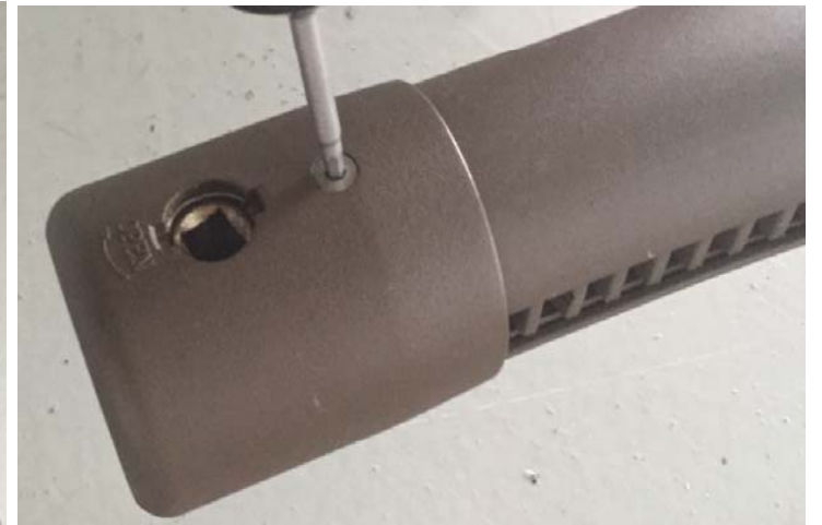
Unsrew and remove the Aluminum cap