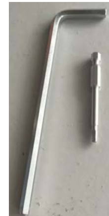
Tools required: two wrenches