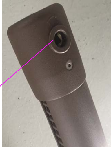
Remove the plastic cap