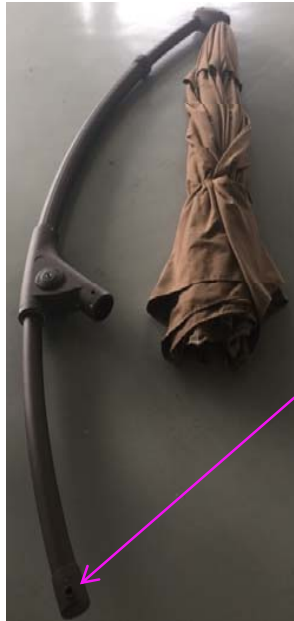
Lay down the umbrella